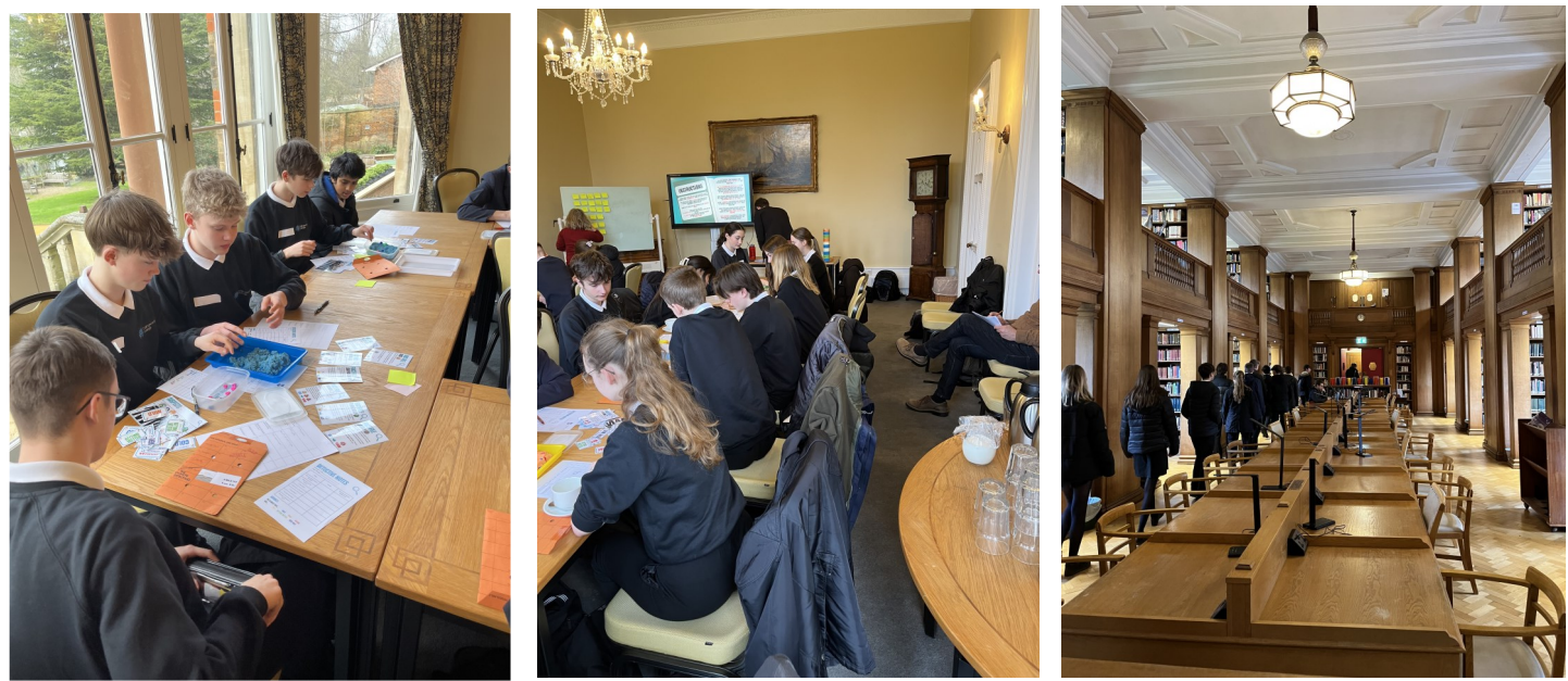
On Wednesday 22 January 15 Year 10 students travelled to Oxford to visit St Hilda's College at the University of Oxford.

"I learnt more about Oxford University and what I should be looking for when applying for universities."